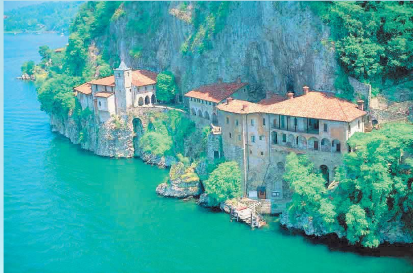
The Hermitage of Santa Caterina Del Sasso A UNESCO Heritage Site